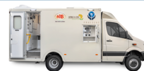
Fully equipped & connected Mobile Lab to test for Ebola, HIV, Tuberculosis, Malaria etc.

Upon the request of the Congolese authorities, the Praesens Foundation, in collaboration with Africa CDC, has decided to send a Mobile Lab to ramp up the diagnostics capabilities in Goma, border area in the province of North Kivu which is undergoing the largest Ebola outbreak ever recorded in the country. The airlift was provided by the Fondation Mérieux who chartered an Antonov 124 that took off from Lyon in October 2019.