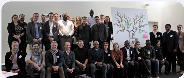
Praesens Future Health Threats Initiative 2019, imec, Leuven Public-private cooperation to strengthen health security in Africa with a focus on Bio-IT & Genomics