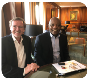
Public Health Partnership Agreement signed with Africa CDC

to infectious diseases control: sponsoring a well in Senegal that recognizes the unmistakable link between access to water, decent sanitation and public health outcomes.